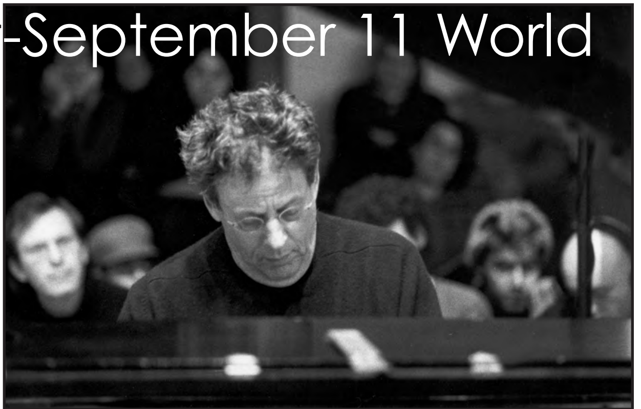
Philip Glass (above) performing at the 27th annual New Year's Day Marathon at the Poetry Project at St. Mark's Church in-the-Bowery, a day of performances informed by 9/11. Chambers Street (below) September 12, 2001.

What about the quiet dissolution of the Anti-Ballistic Missile Treaty on the day that the mysterious tape of